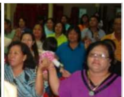
Angels we have heard on high, Singing sweetly through the night ...