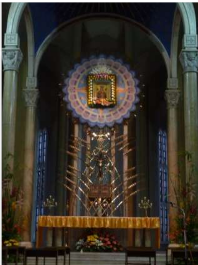
Left - National Shrine of Our Lady of Perpetual Help, Baclaran