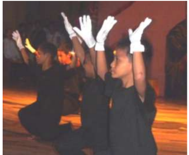
Above & Below - Performances in Baclaran