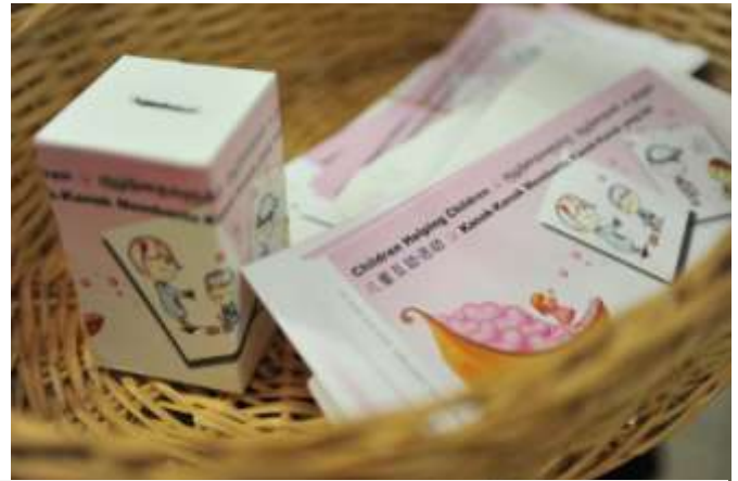
Children learning to give to the needy ... World Mission Sunday 2009 @ COOL