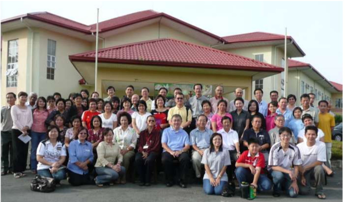
Bishop and participants of Life in the Word retreat, Pace Bene, Papar

The retreat was held at the Franciscan Sisters' retreat house Pace Bene, in Papar, where the last two Joint Vicariate Confirmation retreats were also held. About 60 participants attended the retreat.