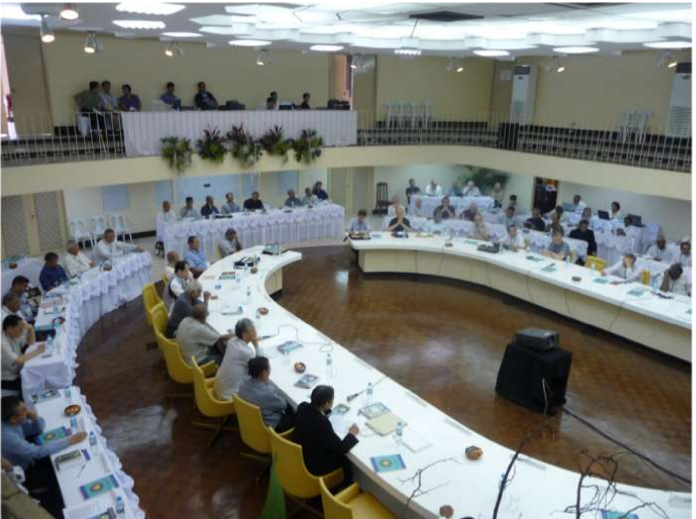
Plenary Session in Progress